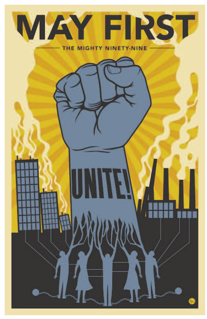
R. Black, Oakland

over and occupying it, even if for only a period of time. Many of these occupied spaces then organize internal forms of conflict resolution, from the mediation group in Occupy to the "security" teams in Egypt and Greece, and a group with a very similar intention called "Respect" in Spain. To look at the images from Tahrir Square in Cairo, Syntagma Square in Athens, Zuccotti/Liberty Plaza in New York, or Puerta del Sol in Madrid, to name only a few of the thou-