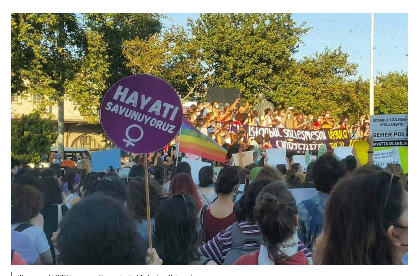
Women and LGBTI+ communities protesting Turkey's withdrawal from the Istanbul Convention originally introduced to protect girls and women from all forms of violence. Kadıköy, 2021.

by Ece Kocabiçak, The Open University, UK