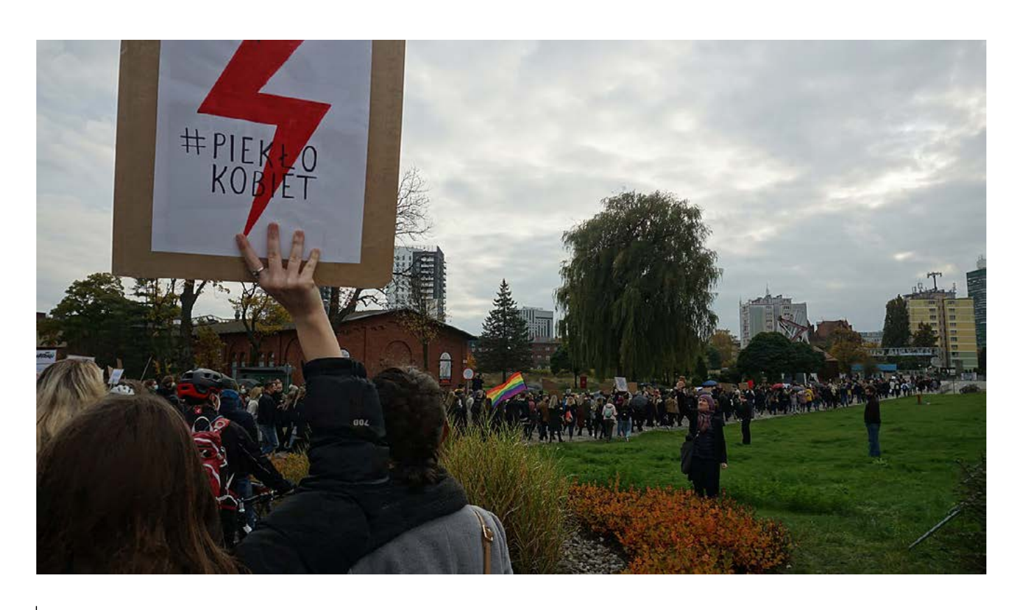
The hashtag #piekłokobiet (hell for women) has become a symbol for the protest against the new laws restricting access to abortion in Poland.