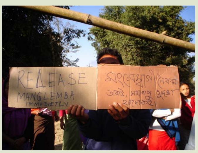
A protest for a young man arbitrarily picked up by the Indian army in 2011.

To negotiate access and expand the "field," I took an interdisciplinary approach, supplementing field narratives by incorporating poetry written between 1980 and 2010. In 1980, AFSPA was extended to the whole of Manipur. I used the poetry of the period to understand how the culture of fear is reflected in poetry (other cultural artefacts, such as