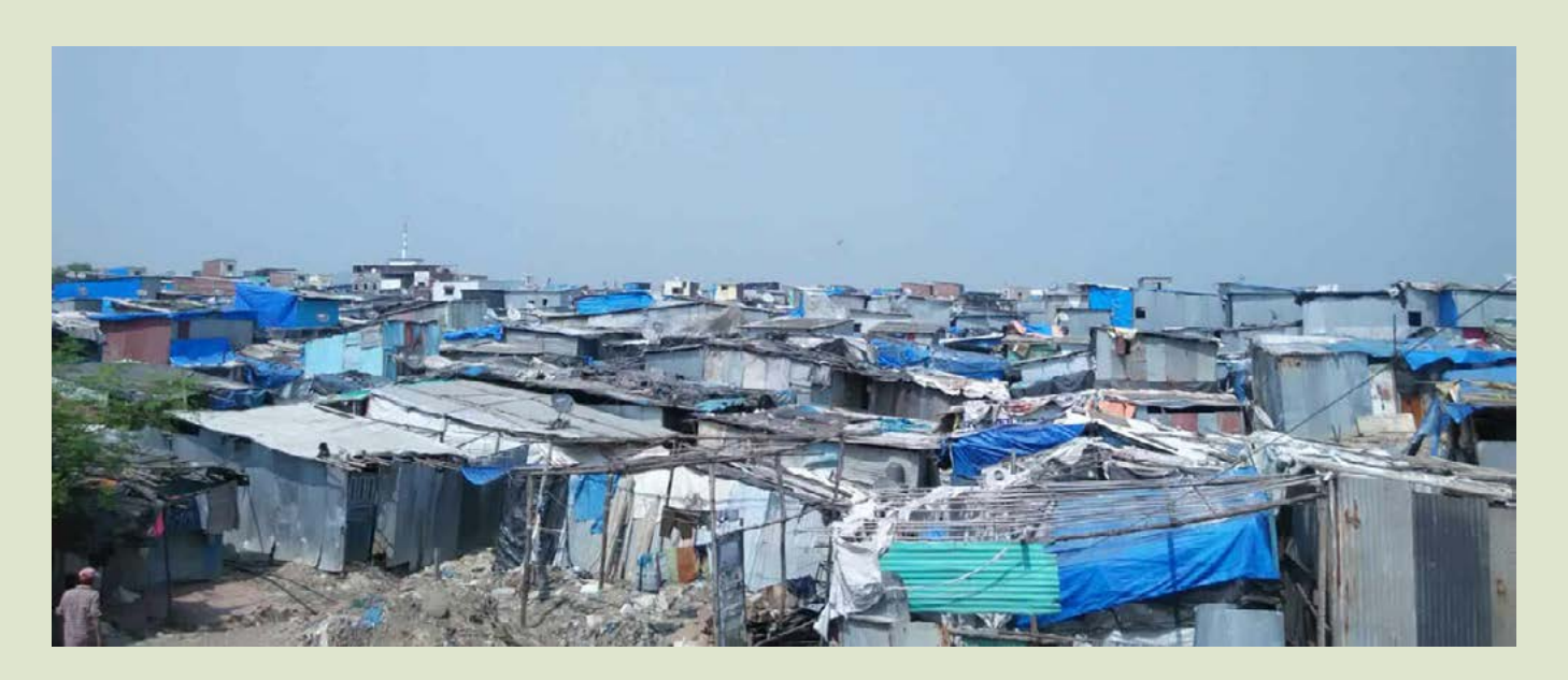
Deonar is a suburb of Mumbai which has gained prominence for being the biggest landfill in the city.