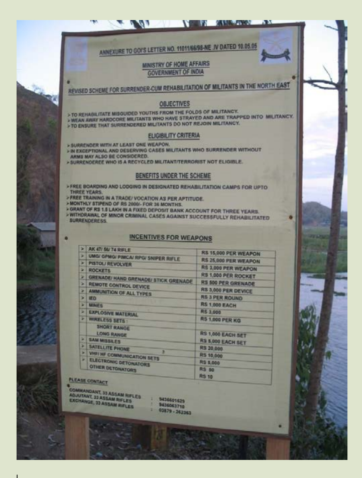
A signboard near Karang in the Bishnupur District of Manipur state, in April 2011.