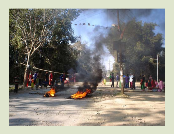
Protest actions like this one are common occurrences. Credit: Soibam Haripriya, 2011.

Eschewing terms that evoke pejorative meanings of being agents of the state's military apparatus is the first step to negotiating trust. Secondly, there is a general resistance to research investigation. It is felt that research tools fail to capture the historicity of violence and end up reproducing the colonial ethnographic representation of people as inherently hostile and suspicious of each other and of those outside the community. On the one hand, "outsider" research must foray into such fields as the question of complicity, even if one does not actively consent to the project of state violence. On the other hand, since the field fosters mutual suspicion, access to the field is inevitably mediated by one's identity. As present conditions of the social have been shaped by years of militarization, the adequacy of the tools and methods needs to be questioned. Thirdly, as a supposedly "insider" researcher, I found access to the field more fraught as people categorize kin, friends, and institutions in terms of affinity to either the state or the non-state. Most discussions on field and methods grapples with how to discern whether "informants" are telling the truth. However, in such field sites, the researcher is in a position of reverse gaze; that is, the question of truth, falsification, and trustworthiness - usually applied to the field - now come to bear on the researcher.